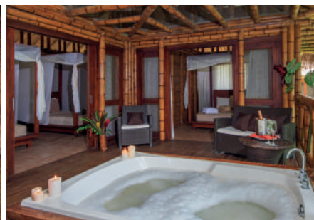
FAMILY SUITE 56 sq. m. / 602 sq. feet