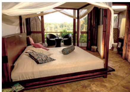
SCENIC SUITE 25 sq. m.