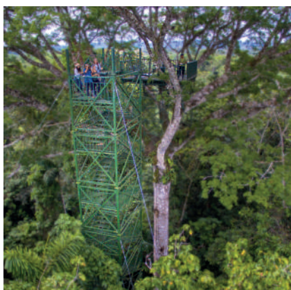
OBSERVATION TOWER (38 m)