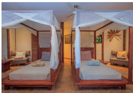
SUPERIOR SUITE 37 sq. m. / 398 sp. feet